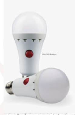
Self-charging Lightbulbs. 280 lllumination; up to 5 hrs emergency use in power outage.