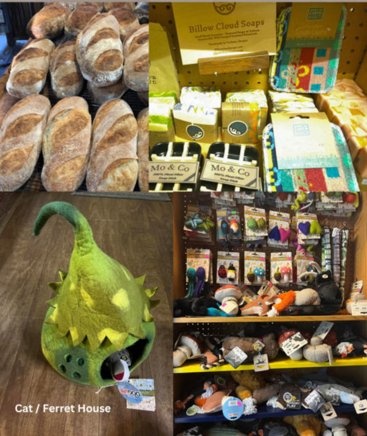
Cat / Ferret House

Our Yachats Mercantile is more than a great little hardware store. Find a treasure of games, puzzles, novel gifts, clothing, a small deli case, fresh Drift Inn breads, cookies, frozen entrees, soups... You can also find handcrafted soaps, crafts, doggie goods, and new wonderful surprises like self-charging light bulbs!